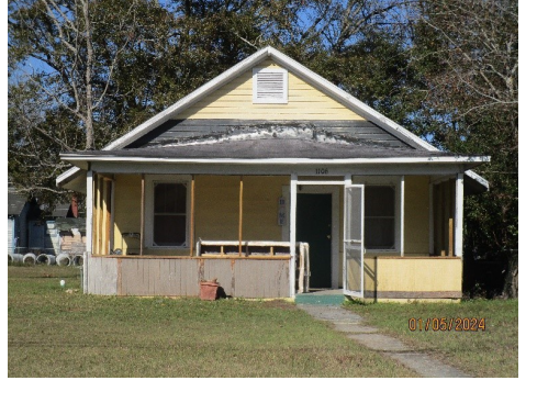
Left: A home within the Waycross Target Area in need of rehabilitation.